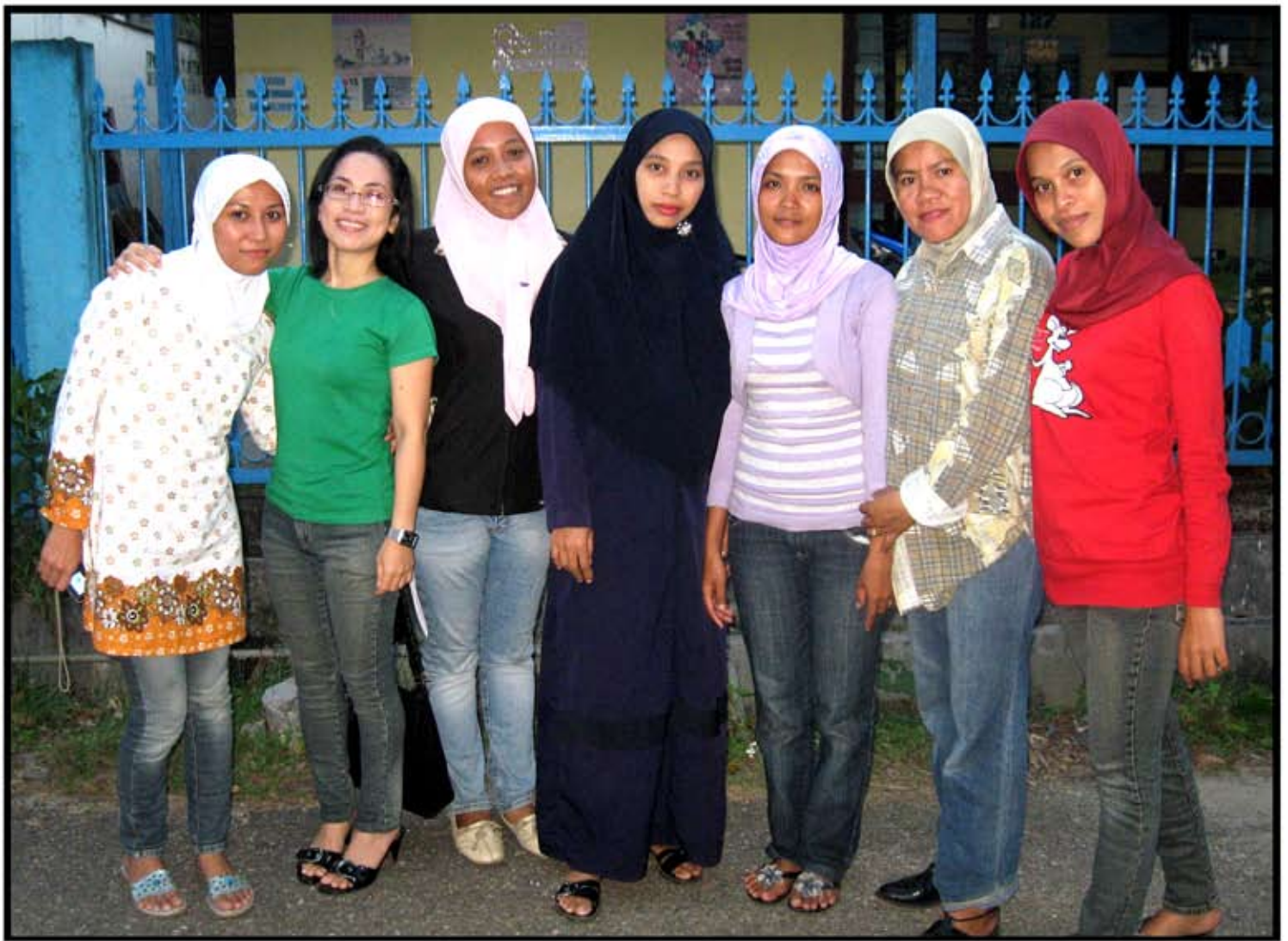
Team Alpen outside the office of the Aliansi Perempuan Sulawesi Tenggara